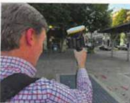
50 Landscape Architect and Specifier News

Students working with Scenic Virginia developed and piloted a community engagement plan for local communities wanting