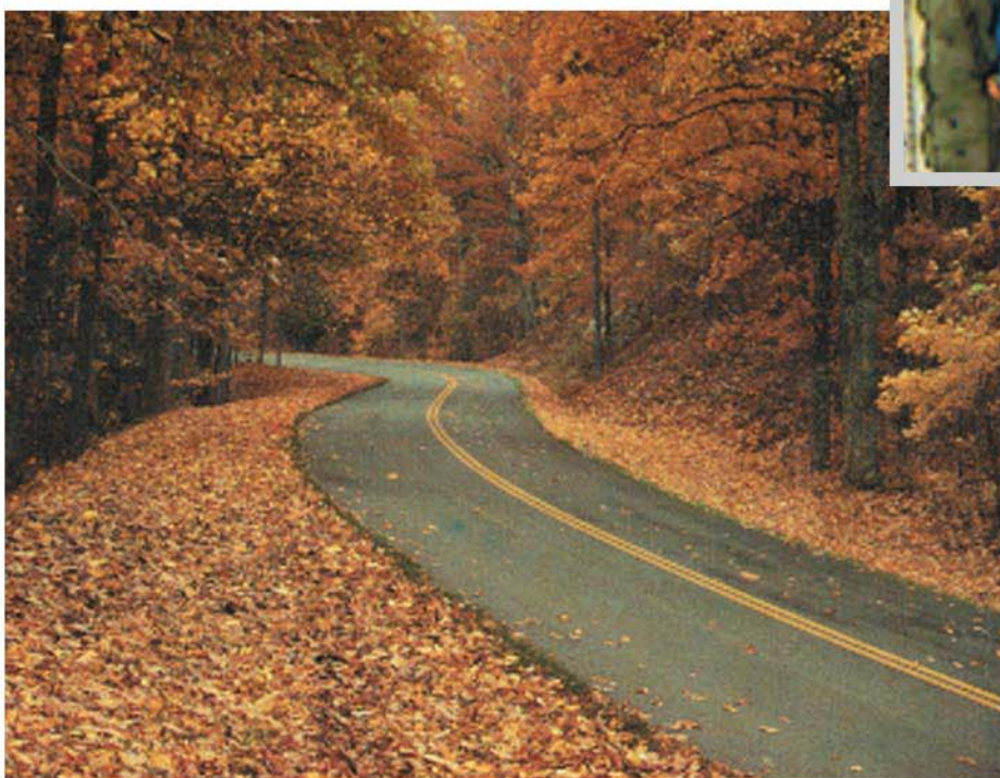
Carlton Abbott and Partners, PC - Visual Character of the Blue Ridge Parkway

To contact a professional in your area or learn more about Virginia's Landscape Architects see: