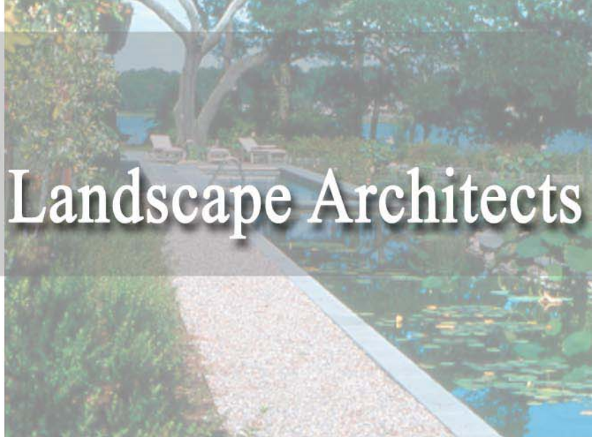
Susan Nelson - Warren Byrd Landscape Architects - Tidal Garden